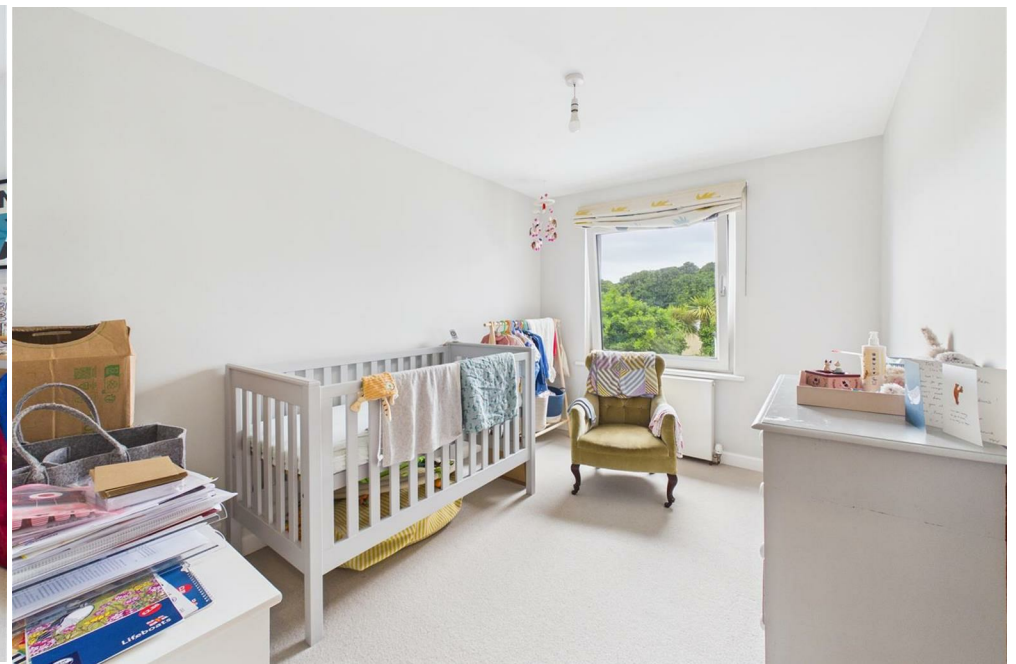
Grist Lane, Angarrack, Hayle, TR27 5HZ